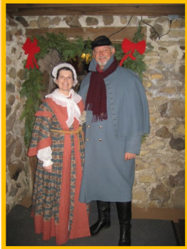
2009 Small Institution of the Year - Illinois Association of Museums